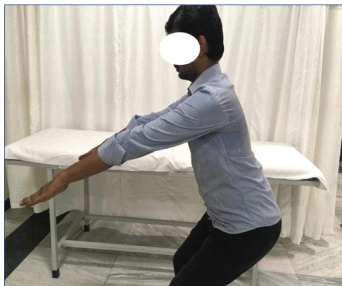
[Table/Fig-1]: Squatting-Lumbar spine in neutral position.

The extension control impairment exercises prevent the lumbar spine from moving into excessive extension. The exercises include posterior pelvic tilting in crook lying and prone lying position in neutral spine which can control excessive lumbar spine extension. The prone straight leg raising exercise was performed with a pillow placed under the abdomen for maintaining the lumbar spine in neutral and unilateral leg lift maneuver was performed [Table/Fig-2].