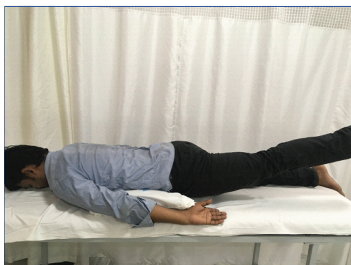
[Table/Fig-2]: Prone straight leg raise-Lumbar spine in neutral position.

Rotation control impairment exercises were prescribed to avoid excessive pelvic rotation and lumbar spine movements during lower limb activities and control is gained by maintaining the spine in neutral position. In prone position, with knee flexion the limb is moved in to rotation without causing any movement of lumbar spine. This procedure is further progressed in crook lying with one limb is moved into abduction without pelvic rotation. In side lying position, one of the limbs is abducted with lumbar spine and pelvis in neutral. The control impairment exercises have been advised to be performed 20 repetitions and two sessions per day.